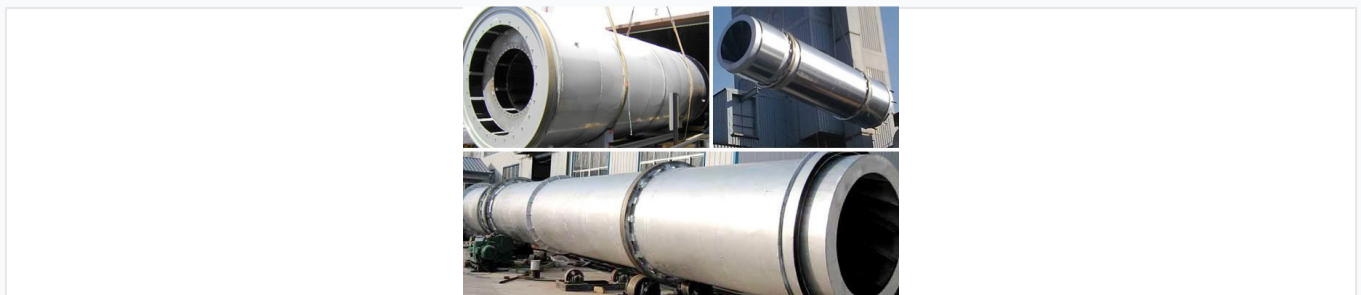
A high-capacity rotary drum dryer designed for continuous industrial operation and efficient moisture removal.