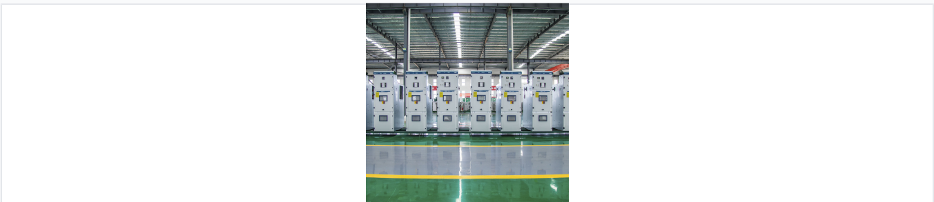
Robust metal-clad armored enclosure designed for indoor power distribution.