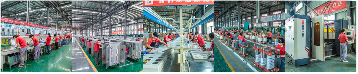
High breaking capacity unit for industrial power distribution.