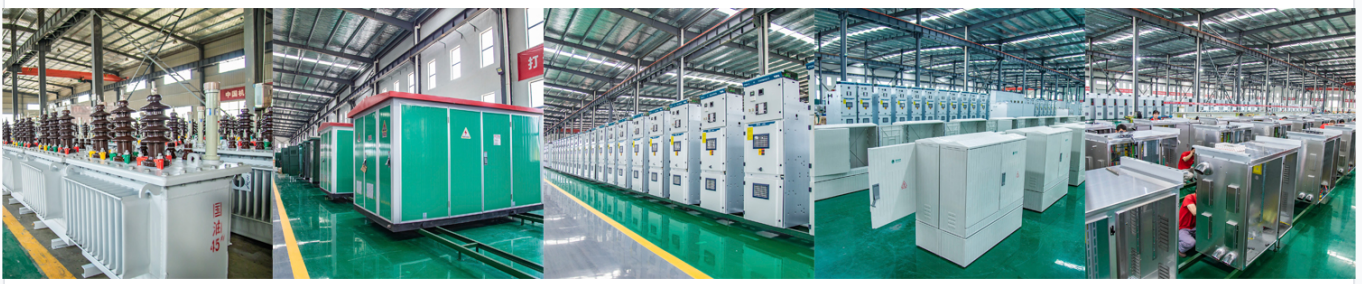
Vacuum interrupter technology ensures long service life and reliable arc quenching.