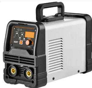
Multifunction control panel featuring digital display and adjustable settings