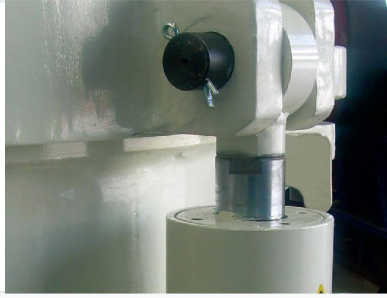
Visual representation of the hydraulic protection and crushing adjustment systems.