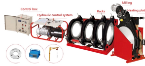
Detailed view of the control box, hydraulic system, milling unit, and heating plate.