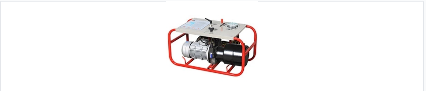
Complete hydraulic butt fusion system including frame, power unit, and control panel.