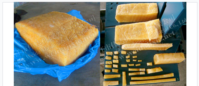
The horizontal cutting machine setup designed for efficient rubber material size reduction.