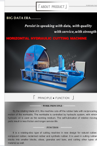
Illustration of the hydraulic system and rotating blade cutting principle.