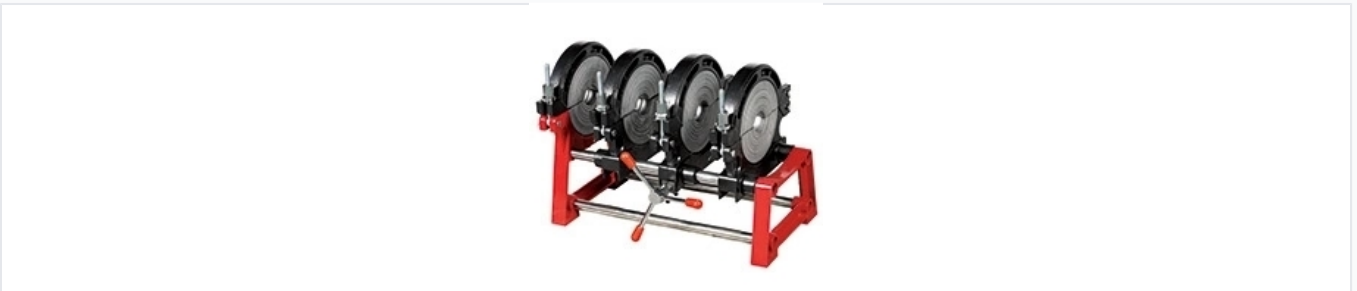
Manual butt fusion welding machine designed for joining HDPE pipes using the hot plate method.