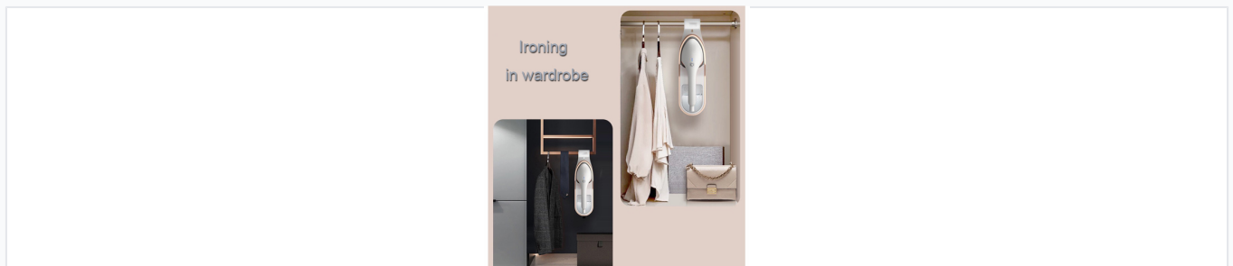
Compact design optimized for wardrobe garment care.