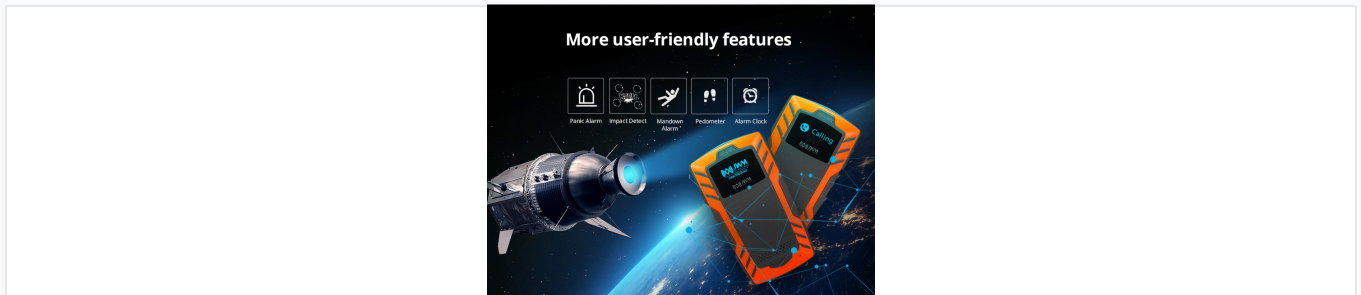
The WM-5000L4D features a ruggedized exterior with an integrated OLED display for real-time status updates.