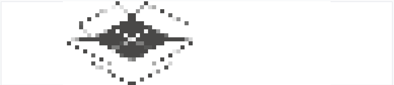
Engineered for efficient material removal and a smooth finish on metal surfaces.