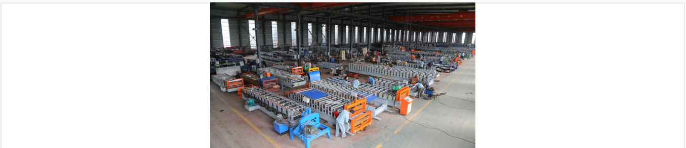
Industrial-grade roll forming equipment ready for high-volume production cycles.