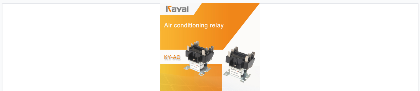
Standard HVAC relay model shown with terminal orientation.