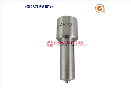
Precision-engineered nozzle designed for optimal atomization.