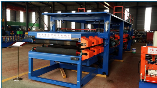
Precision roll forming equipment and automated lamination unit.