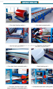
Overview of the integrated workflow from steel feeding to final cutting.