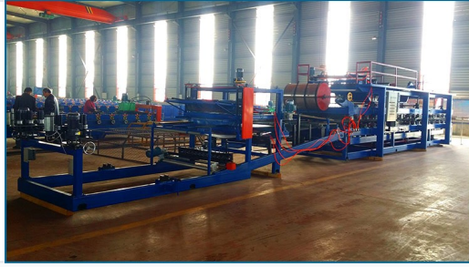
Automated system with integrated heating and bonding stations.