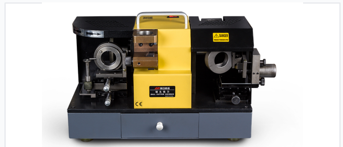
Robust construction designed for stability and consistent grinding results.