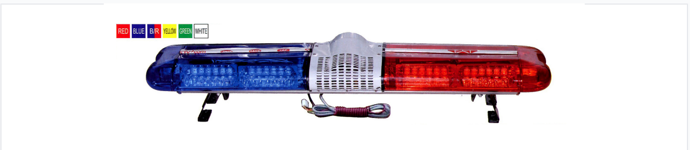
High-intensity LED light bar designed for emergency response, featuring multiple color configurations.