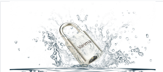
High-security electronic padlock with a durable, weather-resistant design.