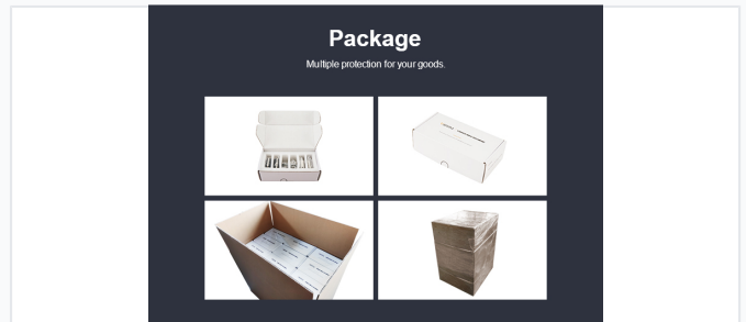
Secure, multi-stage packaging process designed to prevent damage during transit.