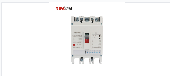
Detailed view of adjustable trip parameters and operational settings.