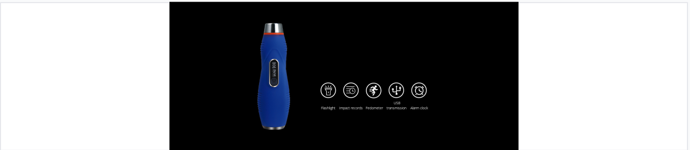
All-in-one compact design featuring flashlight, pedometer, and impact recording.