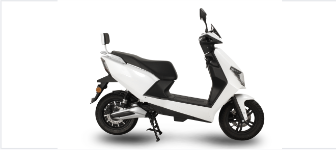
12-inch tires designed for smoother rides and better grip.