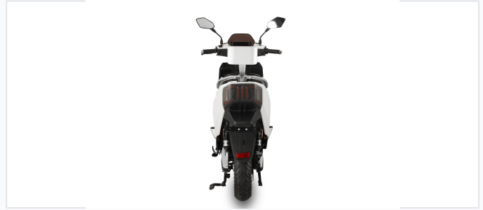
Dual-piston hydraulic disc brakes ensure timely and safe stopping.