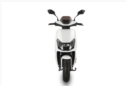
Tail light and rear assembly view.