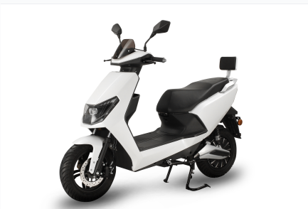
Equipped with bright LED lighting for night safety.