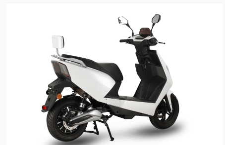
Clear LCD dashboard for essential riding information.