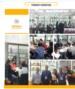
Showcase of kitchen appliance design and utility.