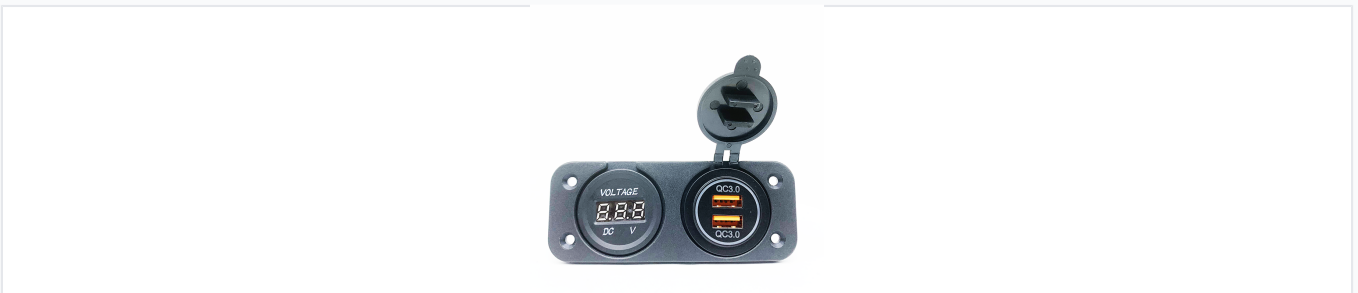
Dual USB charger socket with integrated digital voltmeter and QC 3.0 fast charging capability.