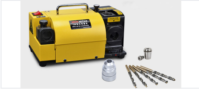
Adjustable point angle settings for versatile grinding.