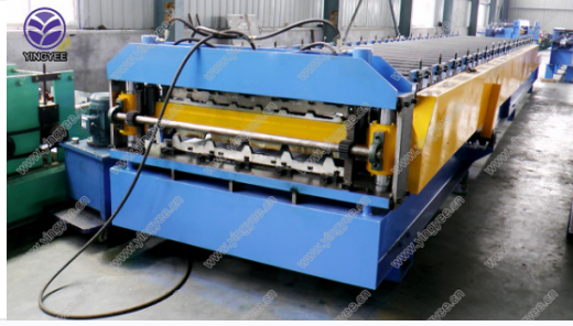
Full production line setup including decoiler and run-out table for 30m/min operation.