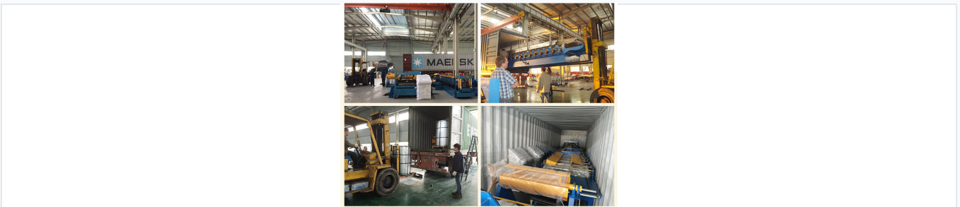
The machine is securely packed for international shipping to ensure safe delivery.