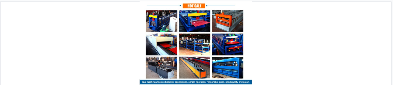
Our machines feature beautiful appearance, simple operation, reasonable price, good quality and so on.

The dual-layer design allows for two different profiles in one machine, saving significant workshop space.