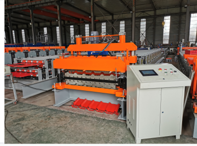
High-precision rollers made from 45# steel with chromium plating for durability.