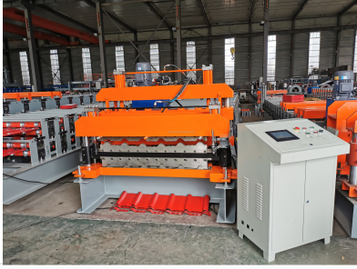
Close-up of the multi-stage rolling process and integrated control interface.