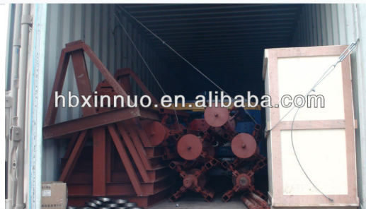
Robust steel frame ensures stability during high-speed operation.