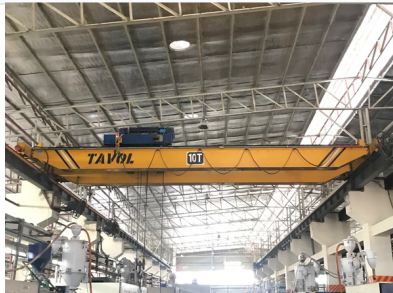
A robust 10-ton double girder crane designed for stable and efficient material handling.