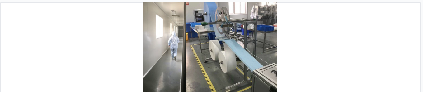
Automated production line ensuring high-volume supply and hygienic manufacturing standards.