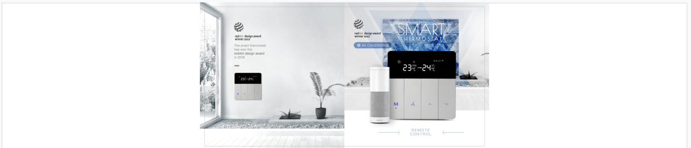
Award-winning design for modern interiors.