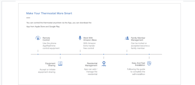
Smart connectivity and remote management features.