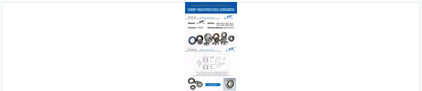
Diagram showing the core components: outer ring, inner ring, cage, balls, and sealing options.