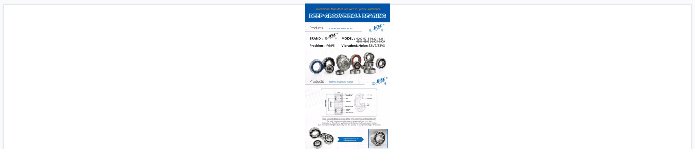
Internal structure showing outer ring, cage, balls, and inner ring with V-groove design.