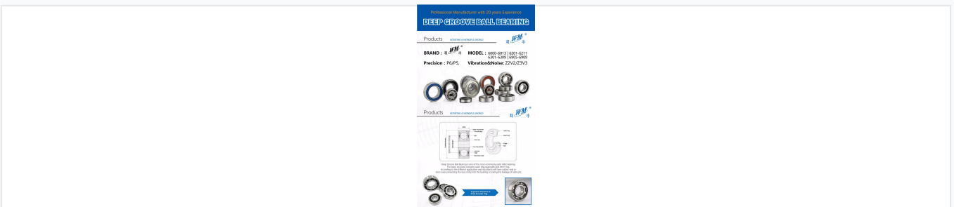
Detailed cross-section showing the inner ring, outer ring, cage, and ball assembly of a deep groove ball bearing.