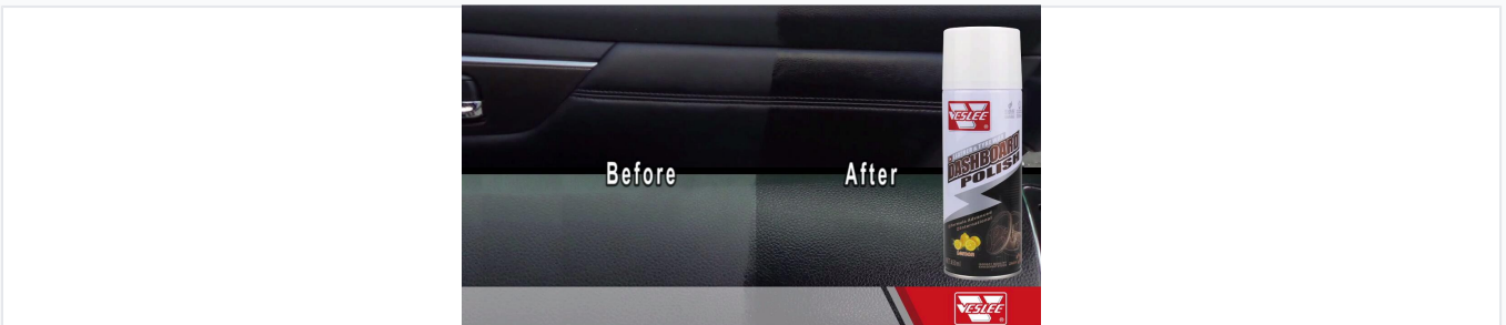
Visual demonstration of the gloss and restorative effect on vehicle surfaces.