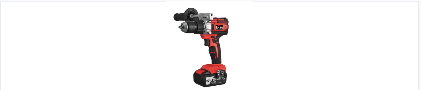
Complete cordless drill kit with battery and charger.