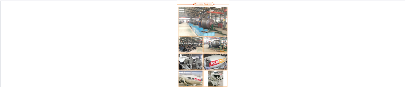
The CTM12 features a high-capacity mixing drum and a reinforced chassis for stable transport.