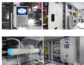
ELECTRICAL UNIT 电器单元

Advanced electrical control system with intuitive HMI interface.