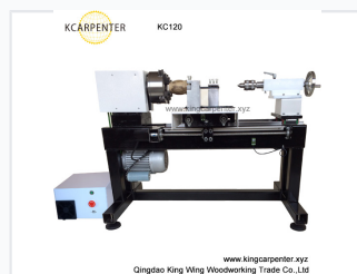
www.kingcarpenter.xyz Qingdao King Wing Woodworking Trade Co., Ltd