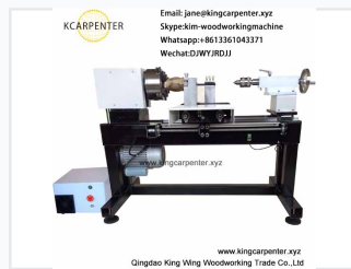
www.kingcarpenter.xyz Qingdao King Wing Woodworking Trade Co., Ltd

Email: jane@kingcarpenter.xyz Skype: kim-woodworkingmachine Whatsapp: +86 13361043371 Wechat: QWWF8033