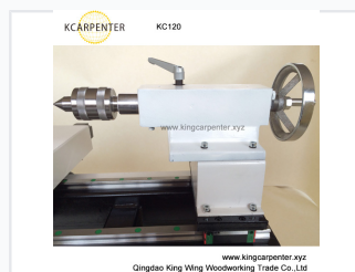
www.kingcarpenter.xyz Qingdao King Wing Woodworking Trade Co., Ltd