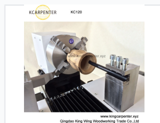
www.kingcarpenter.xyz Qingdao King Wing Woodworking Trade Co., Ltd