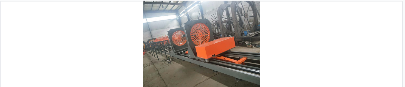
High-volume automated welding system featuring precision wire feeding and programmable control parameters.