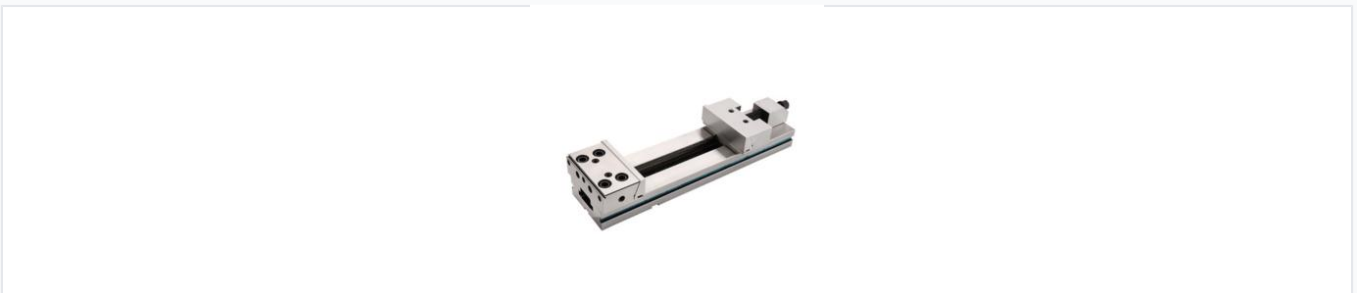
Precision zero point system designed for high-accuracy CNC indexing.