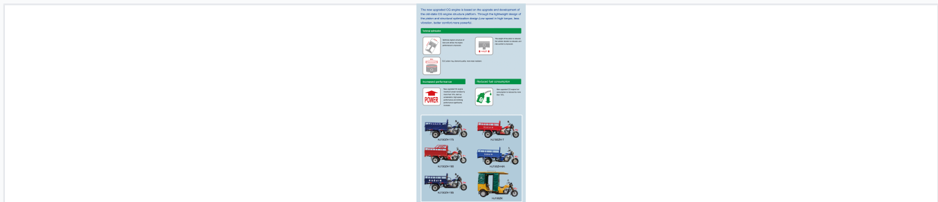
Technical optimization details, including piston weight reduction and performance improvements.