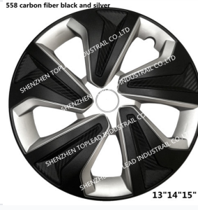
Classic black and silver finish option.