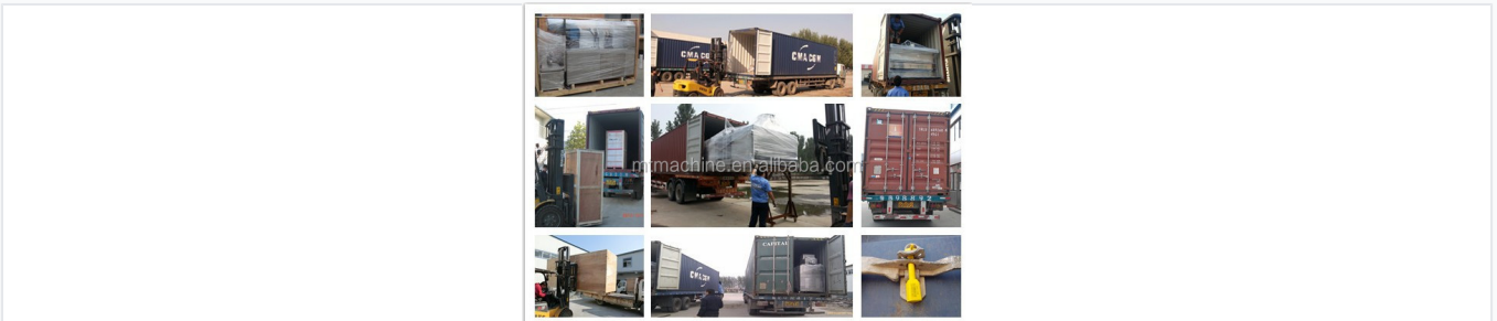
Equipment is securely packed in industrial containers for international transit.