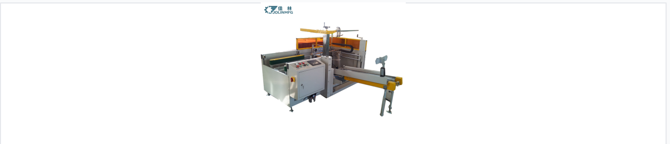
High-speed carton erector designed for efficient case forming and bottom flap sealing.