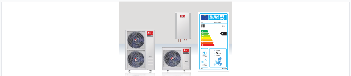
Indoor and outdoor units showing the A++ energy efficiency rating and dual-fan configuration.