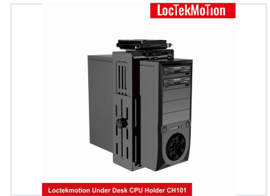
Loctekmotion Under Desk CPU Holder CH101

This adjustable under desk CPU holder mounts directly to the desk underside. It is a stable and secure solution for CPUs in almost any size, freeing up space and helping to avoid accident and damage.