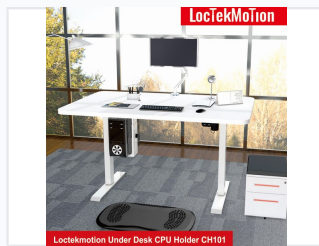
Loctekmotion Under Desk CPU Holder CH101