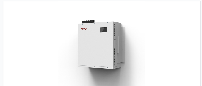
Integrated energy management system for industrial harmonic mitigation.