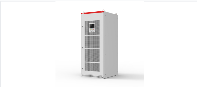
A compact 50A/75A modular AHF unit designed for rack or wall mounting.