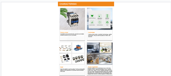
Designed for versatile industrial applications including control rooms and distribution boxes.