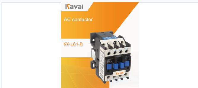
Standard LC1-D AC Contactor unit featuring clear terminal labeling for easy installation.