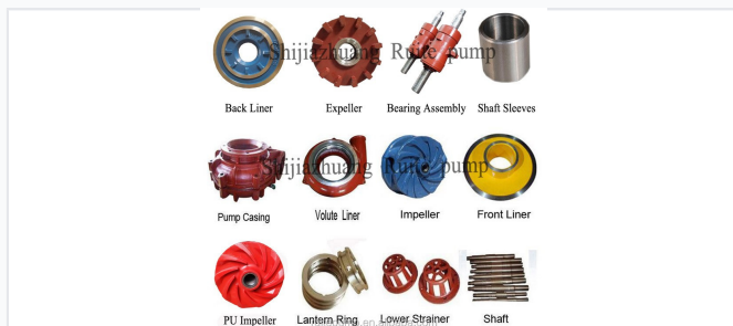
Comprehensive range of wear-resistant spare parts including impellers, liners, and bearing assemblies.