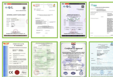
CE Certificate EEC Certificate EN Certificate TUV Certificate

Our products meet international safety and quality standards including EEC, CE, and DOT.